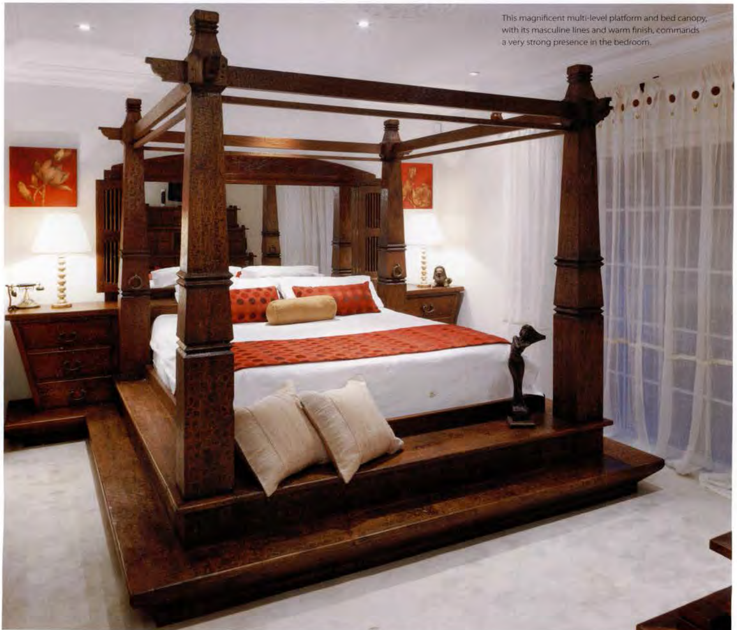
This magnificent multi-level platform and bed canopy, with its masculine lines and warm finish, commands a very strong presence in the bedroom.

Website www.departmentofinteriors.com.au